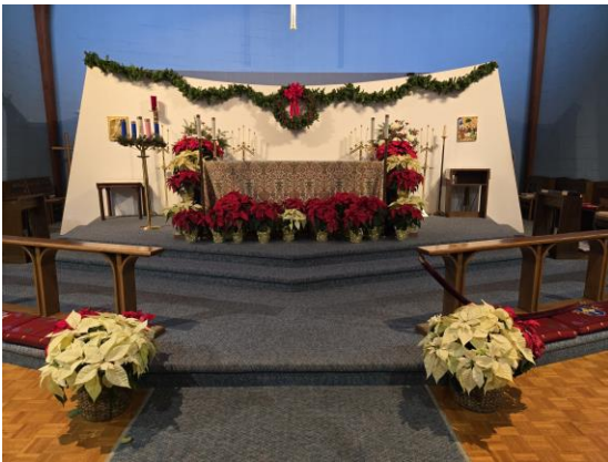
Altar at Christmas