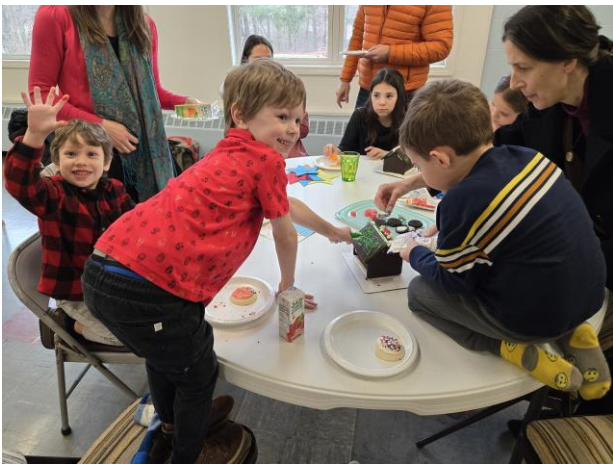
Gingerbread Houses being built!